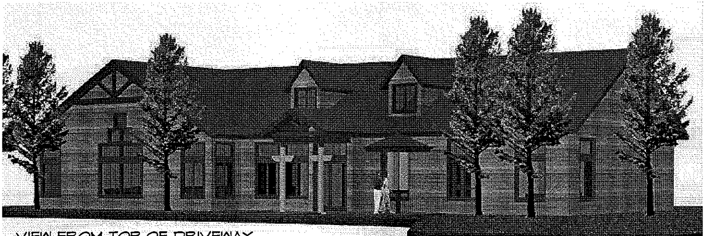
VIEW FROM TOP OF DRIVEWAY

KABETOGAMA COMMUNITY CENTER GAMMA ROAD KABETOGAMA, MINNESOTA