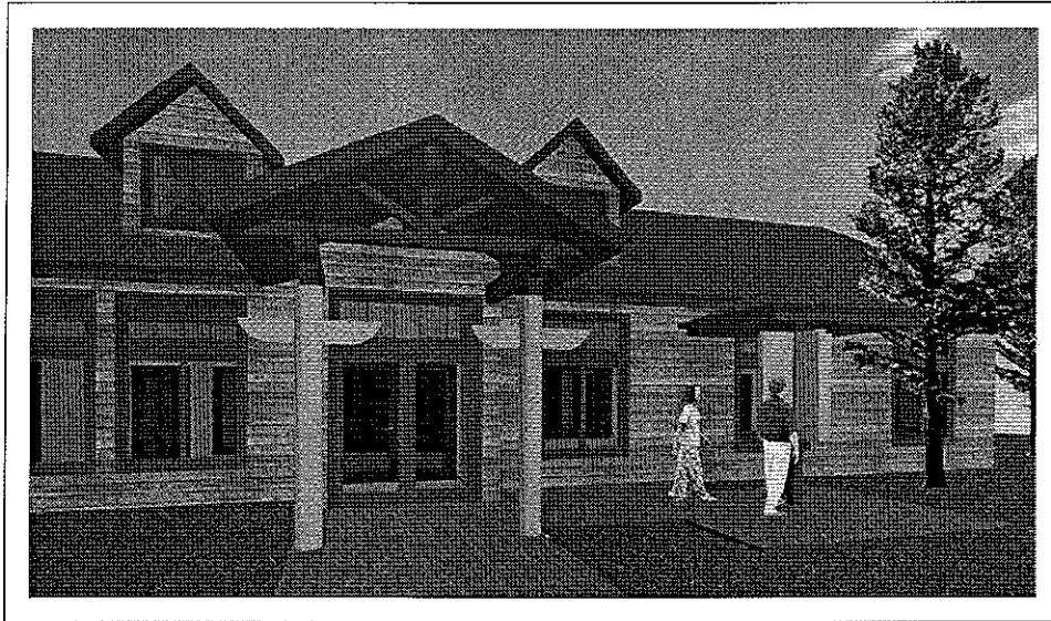
FRONT ENTRY WITH INFORMATION KIOSK